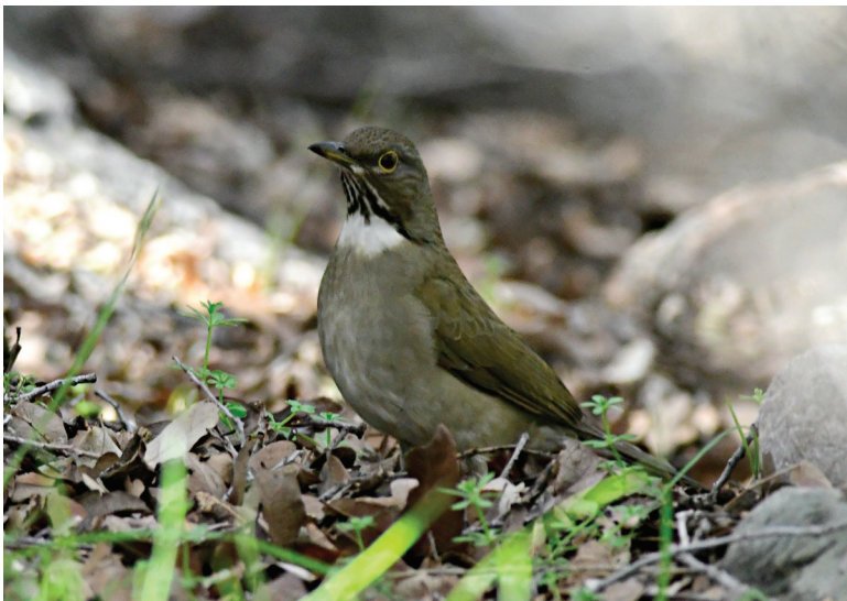
FIGURE 10. This White-throated Thrush in lower Madera Canyon, Pima Co., 9 Jan–20 Feb 2019 established a first Arizona record.