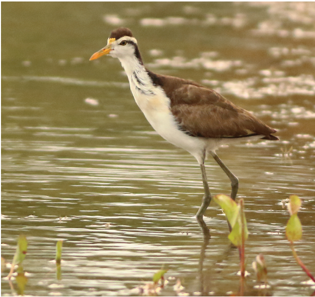
FIGURE 3. Arizona's sixth Northern Jacana was this immature on a golf course in Green Valley, Pima Co., and subsequently at nearby Canoa Ranch, 9–11 Sep 2020.