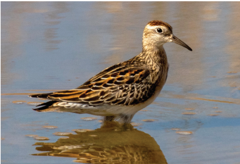
FIGURE 6. Arizona's sixth Sharp-tailed Sandpiper was this juvenile at Spot Road Farm, Yuma Co., 29 Oct 2020.