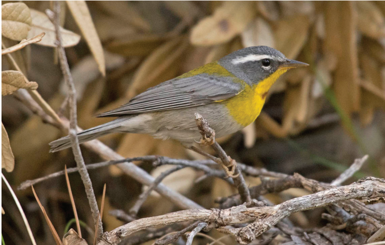
FIGURE 16. This Crescent-chested Warbler was one of at least two along West Turkey Creek, Chiricahua Mountains, Cochise County, 27 Apr–11 Jul 2020, where they attempted nesting, but were apparently unsuccessful in fledging any young.