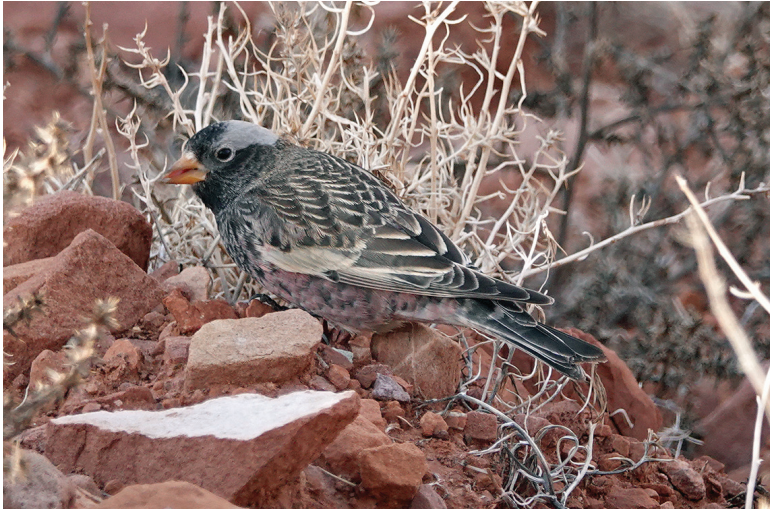
FIGURE 13. One of 75+ Black Rosy-Finches at Echo Cliffs south of Page, Coconino Co., 9 Dec 2018–10 Mar 2019, representing the seventh Arizona record of this species.