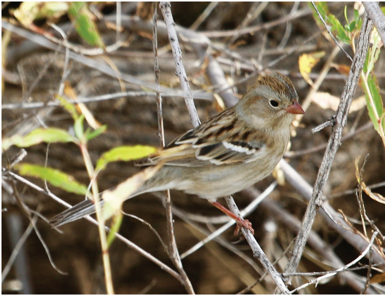
FIGURE 15. This Field Sparrow, at Whitewater Draw WMA, Cochise Co., 20–21 Nov 2020 was one of three in southern Arizona during the fall of 2020; there had been only six previous records.