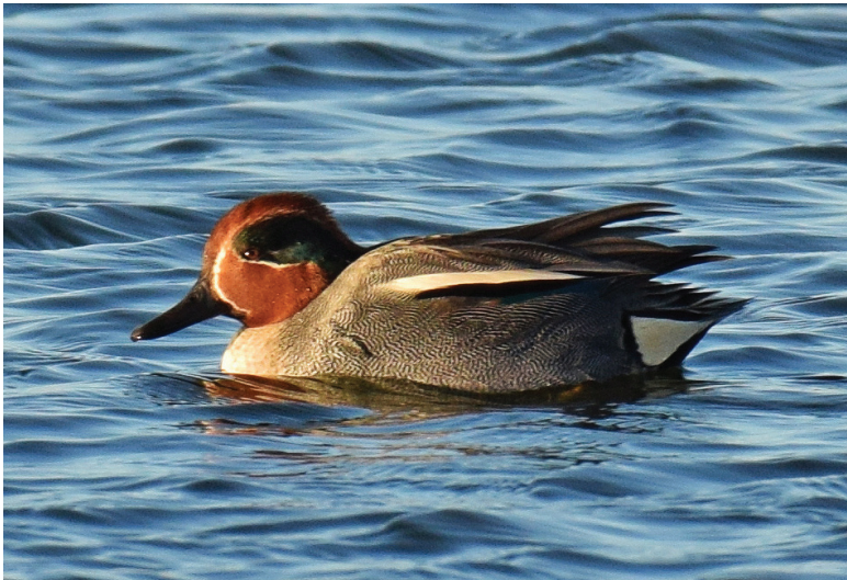
FIGURE 1. This adult male Eurasian Green-winged Teal in Phoenix, Maricopa Co., 3 Jan 2019 provided only the third Arizona record of this form.