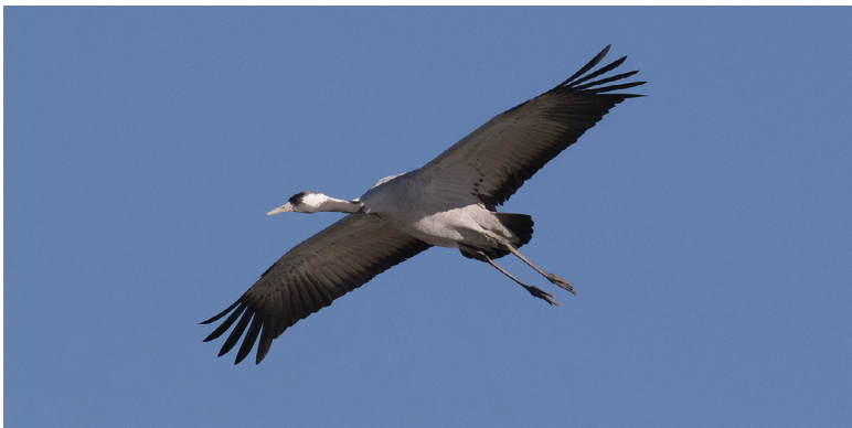
FIGURE 2. Arizona's second Common Crane accompanied Sandhill Cranes at Willcox, Cochise Co., 28–29 Nov 2020.