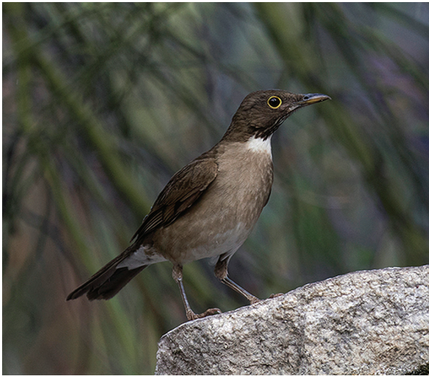
FIGURE 11. Arizona's second White-throated Thrush was in central Tucson, Pima Co., 28 May 2019.