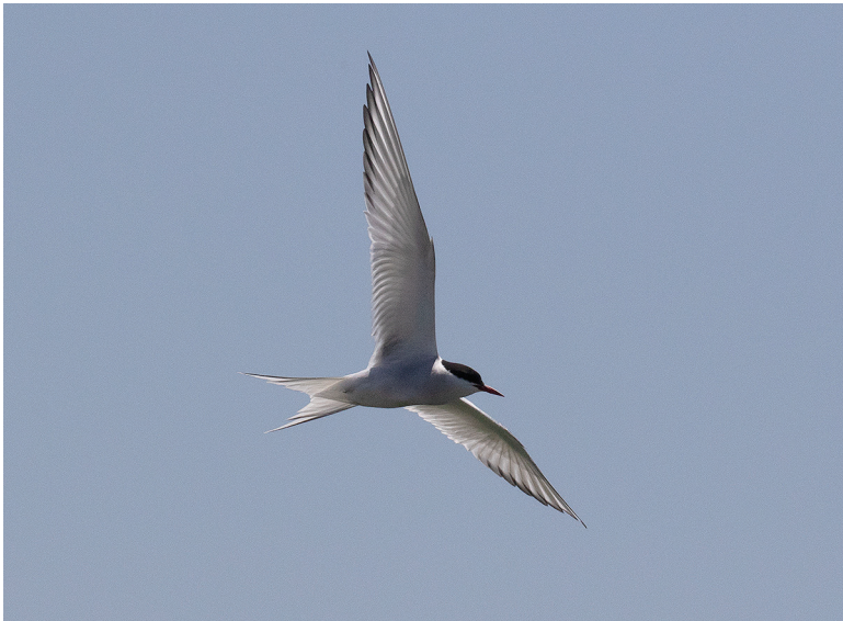
FIGURE 7. Arizona's first photographed Arctic Tern (and seventh recorded) was this adult at Canoa Ranch, Pima Co., 18 May 2020.