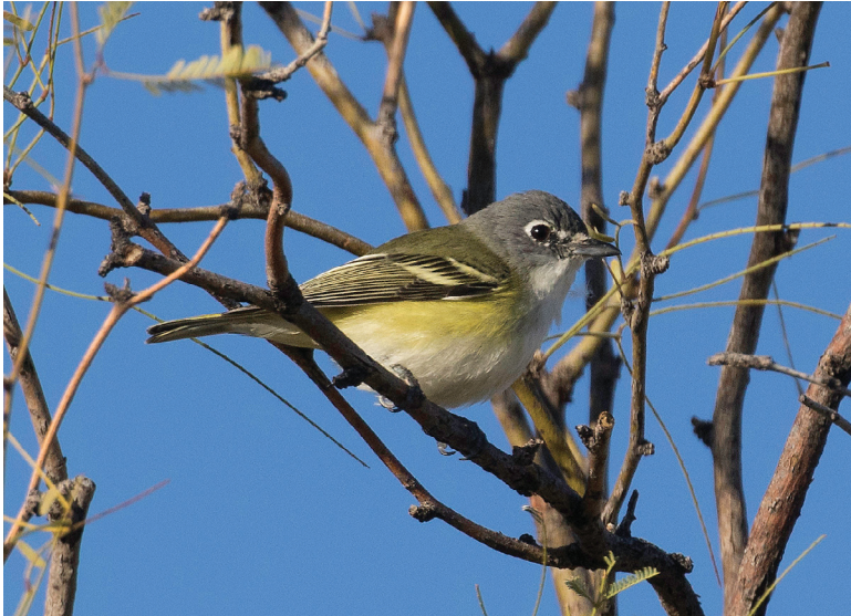
FIGURE 9. Arizona's fifth Blue-headed Vireo was this bird at Ajo, Pima Co., 9–10 Dec 2019.