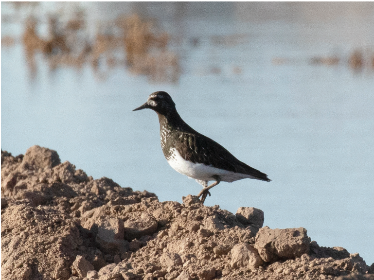
FIGURE 5. This Black Turnstone in Yuma, Yuma Co., 13 May 2020 represented only the second record for Arizona.