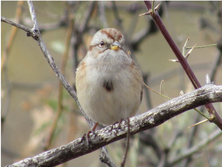
FIGURE 14. This American Tree Sparrow at Badger Springs, Agua Fria National Monument, Yavapai County, represented one of only a few southern Arizona records ever.