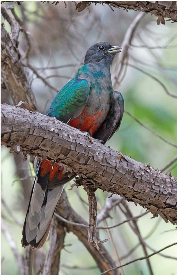
FIGURE 8. This immature male Eared Quetzal was discovered along the Herb Martyr Road in Cave Creek Canyon, Chiricahua Mountains, Cochise County; 8–16 Jun 2020, and spent the summer and most of the fall wandering around the mountain range before settling back in Cave Creek Canyon, where it was last seen 25 November.