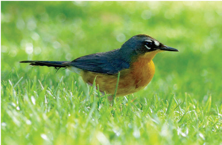
FIGURE 17. Arizona's 11th Fan-tailed Warbler was in Whitetail Canyon in the Chiricahua Mountains, Cochise Co., 13–18 Apr 2018.