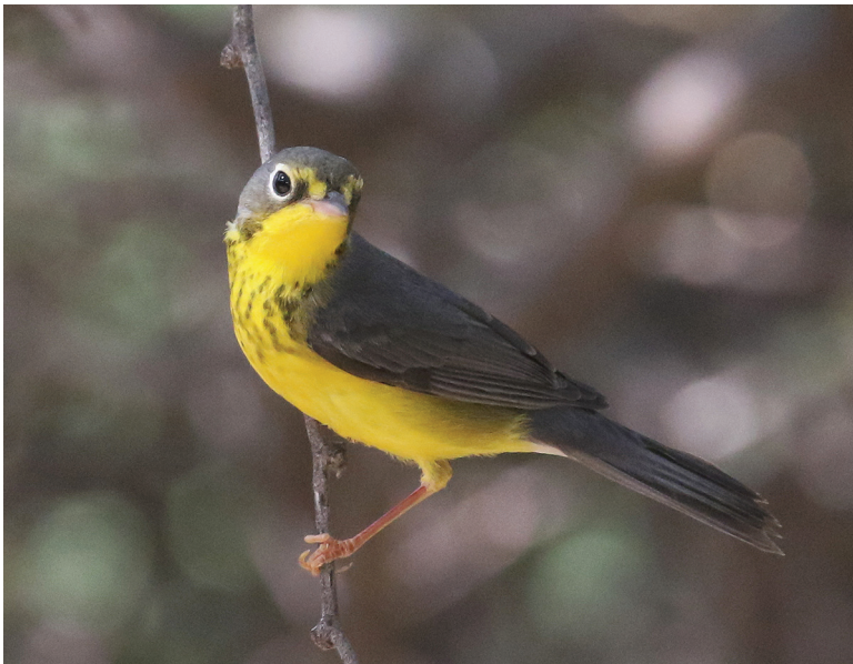
FIGURE 18. This Canada Warbler at Gilbert Water Ranch, Maricopa County, 12–15 Sep 2020 was one of three different Canada Warblers found in Arizona during the fall of 2020.