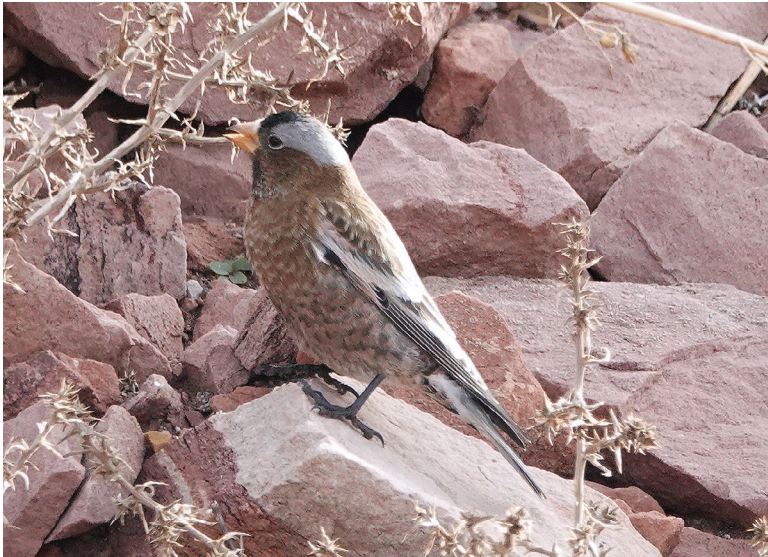
FIGURE 12. One of two Gray-crowned Rosy-Finches in a flock of 75+ Black Rosy-Finches at Echo Cliffs south of Page, Coconino Co., 9 Dec 2018–10 Mar 2019, representing the third record of the Gray-crowned for Arizona.